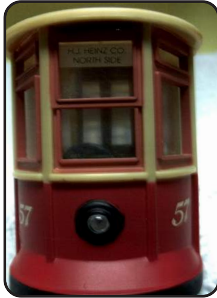
Front of car showing the destination sign

As I was clearing up my den after many years of just placing stuff all together on shelving (books, toys, trains, collectibles, and newspaper clippings), I came across an item which seemed to be screaming “use me in the Under the Wire column”.