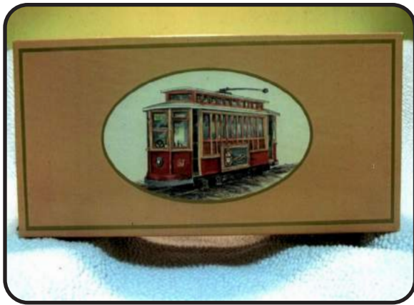
Cover of the box showing painted picture