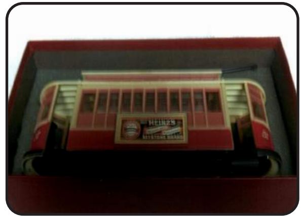
Inside of box showing the foam packing