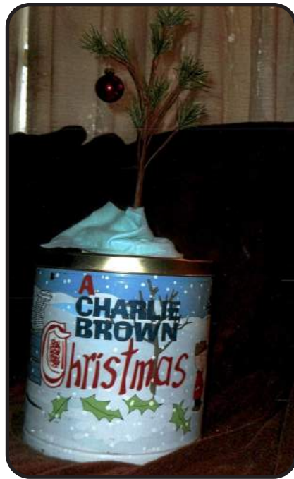
A model tree and popcorn can from that movie

Perhaps the most remembered film from the past is “A Charlie Brown Christmas” which today has to be a classic. It debuted December 9, 1965 on CBS.