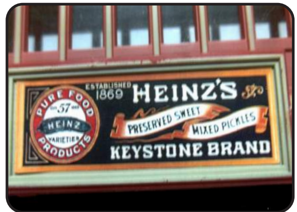
Advertising sign on sides of car

According to a receipt still in the box, I purchased it September 23, 2007 at the Antique Depot for $28.00, $29.68 with tax. That was in the days that Diane and I both still worked and she still gave me an allowance for things like this.