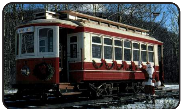
Santa Trolley at Rockhill Trolley Museum

In closing, the staff of the Coal Bucket hopes everyone will enjoy this issue and want to wish all a very Merry Christmas and a Happy New Year!