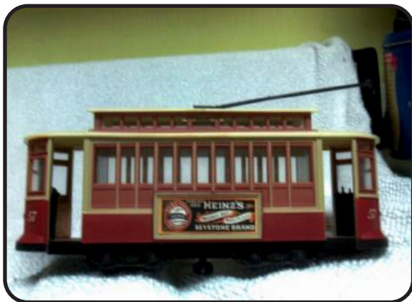
The side view of the model trolley car