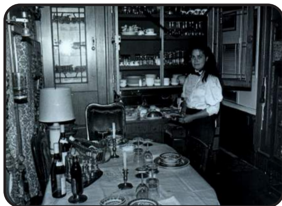
The maid preparing a meal aboard the car while in Altoona.

Dante decided to restore the car to be used as his personal home while traveling. It has a full kitchen, dining room, two bedrooms, a bathroom and the rear observation room/bar. When he travels he also has a maid along to keep things tidy and serve meals.