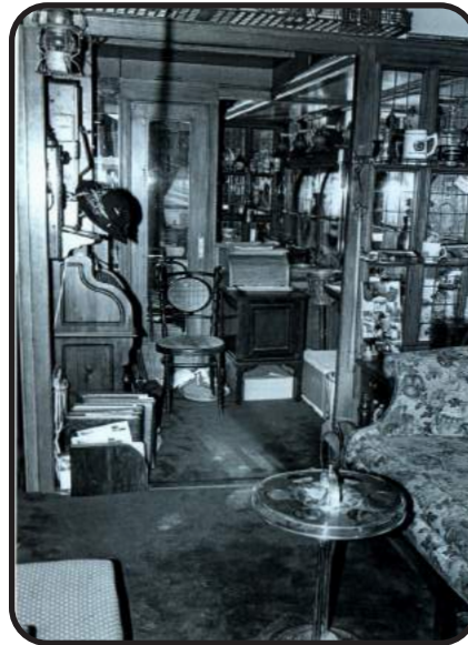
Inside of his car showing some of his collection of railroad artifacts.

The car he purchased was built in 1926 by the American Car Foundry for the F.W. Woolworth family. It is 82 feet long, 10 feet wide, and has 10 foot ceilings. It weighs about 103 tons.